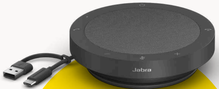
MS TEAMS & UC VARIANTS

To help take care of our planet, we consider sustainability carefully at every stage of product development. The outer casing of Speak2 40 is made with over 50% sustainable materials** and has a number of built-in parts that can be repaired or replaced. Better sustainability = longer speaker life = great calls for you and your team for years to come.